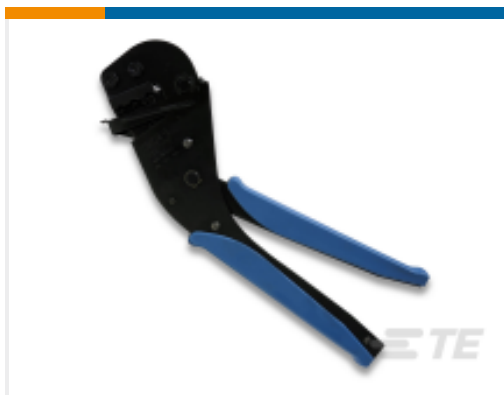
TE Part # 1SET191002R0000 TET CRIMP-HT